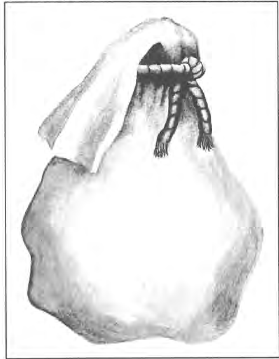
David Defeats Goliath